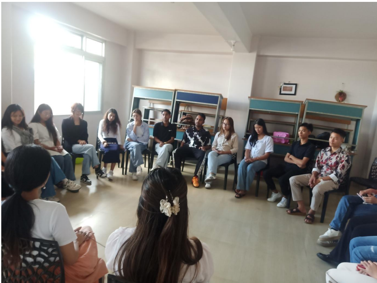
Figure 2 Connect through stories