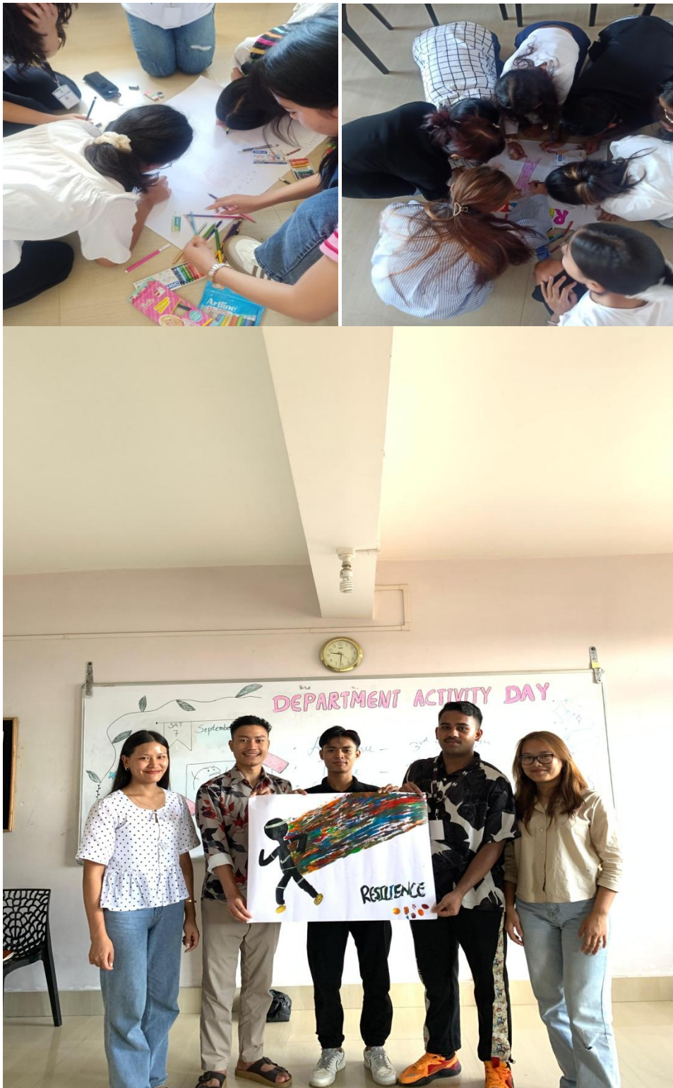
Figure 3 Winner of collaborative art