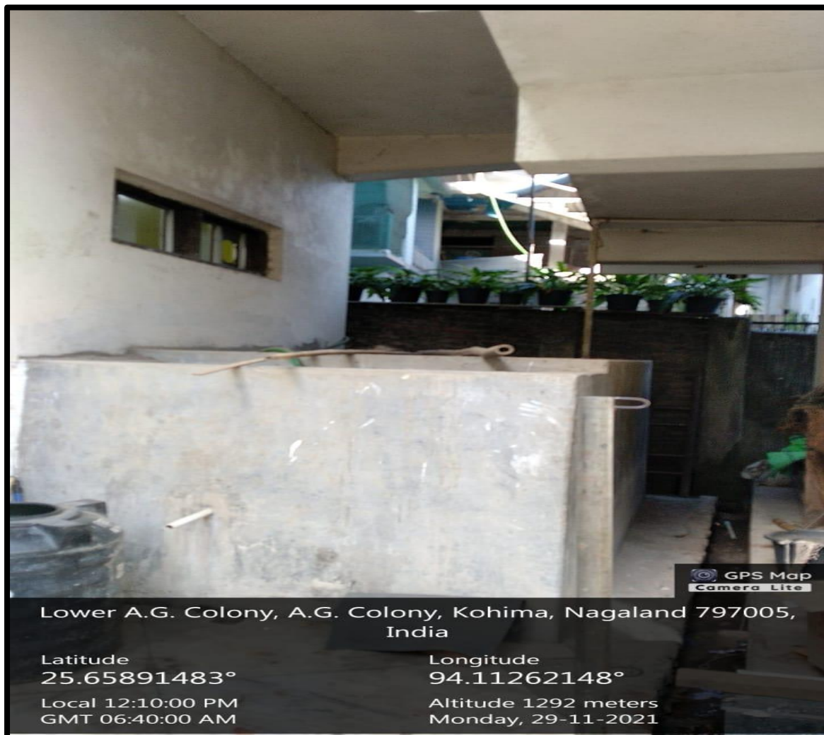
Rooftop water harvesting

Geotagged images are given below for reference.