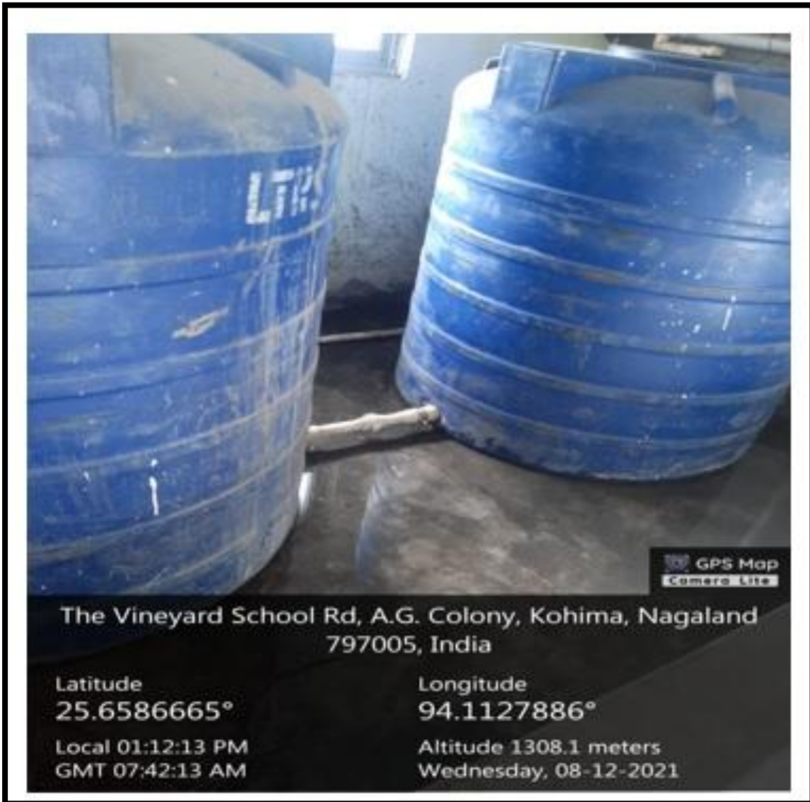
Maintenance of water bodies and distribution system in the campus

Asai 07/03/2022 Principal Model Christian College Kohima : Nagaland.