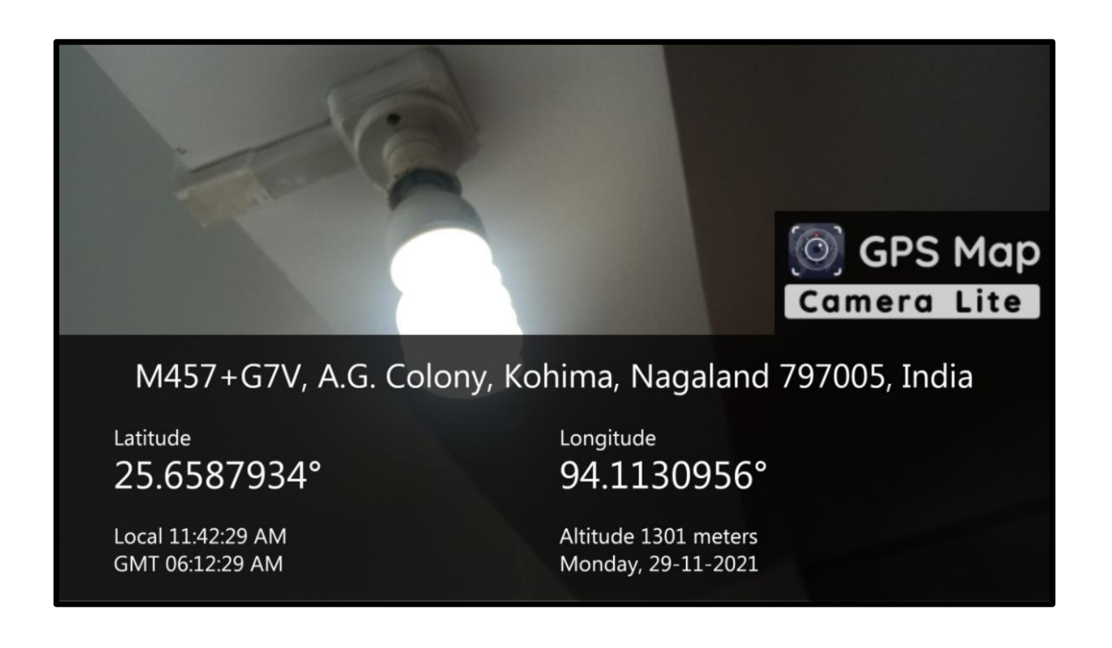
Use of LED bulb/power efficient equipment

Geotagged images of the following can be referred below: