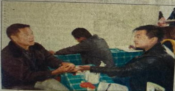
A medical staff collecting blood samples from one of the participants at Model Christian College Kohima on January 19.