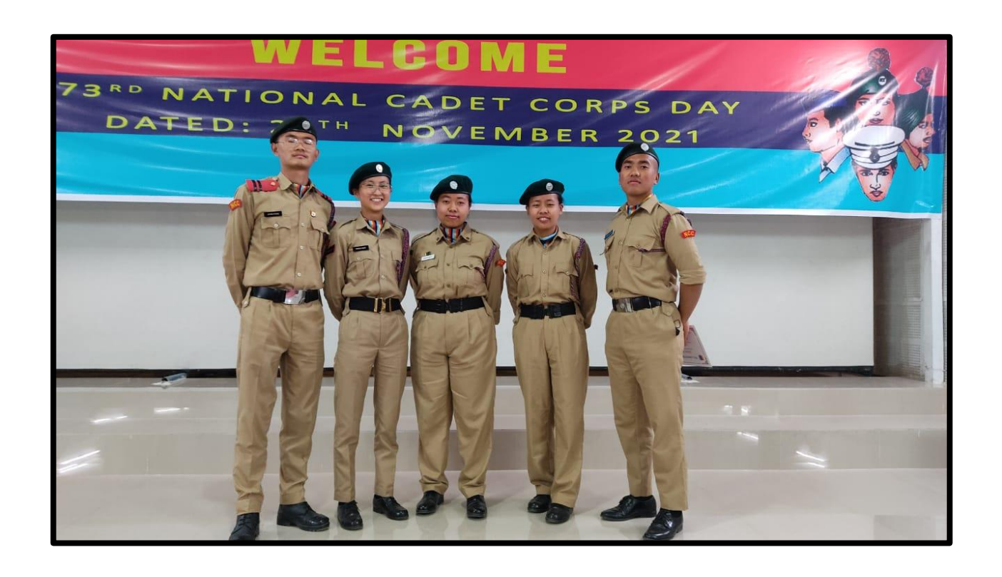
Five (5) cadets of NCC attended the Felicitation of Indo-Pakistan 1971 war veterans and Noks organised by the 24 \text{ Nagaland NCC (i) } coy, on 29^{th} \text{ November } 2021.