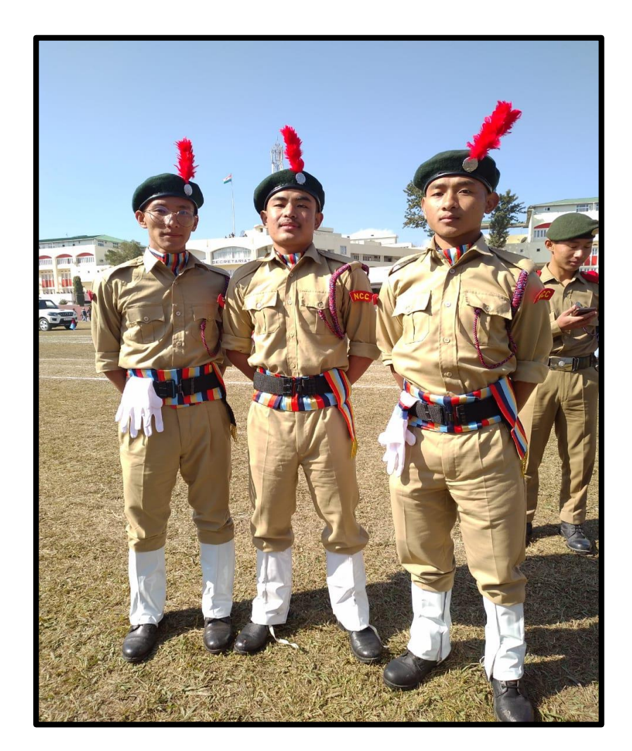
Five (5) NCC cadets of Model Christian College participated for the 26<sup>th</sup> January Republic Day celebration in New Secretariat Plaza Kohima, Nagaland, on 26<sup>th</sup> January 2020. Five (5) students participated.